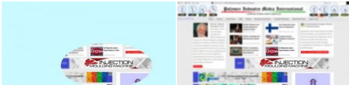
PIMI Home Page position

1- Row 01 in the table: This is the "ONLY ONE" and not repeatable position of an advertisement at the heart of PIMI website