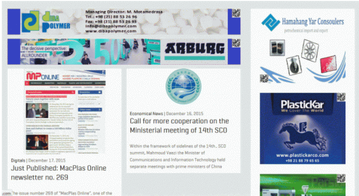
PIMI Home Page, 1st Scrolled page (2nd half)

Row 03 - 09 in the table: All price bases and positions mentioned at the price table, corresponds to the positions showing at the next 3 cropped images of the PIMI home page. Advertisements at top of main news column and the right position of this column have been given most fair prices because of its position importance: