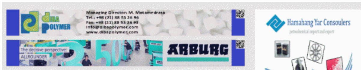
An image of the top adverts (Rows 03 of the table)